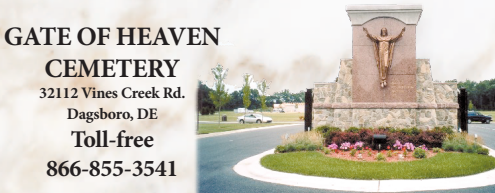
GATE OF HEAVEN CEMETERY 32112 Vines Creek Rd. Dagsboro, DE Toll-free 866-855-3541