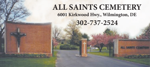
ALL SAINTS CEMETERY 6001 Kirkwood Hwy., Wilmington, DE 302-737-2524